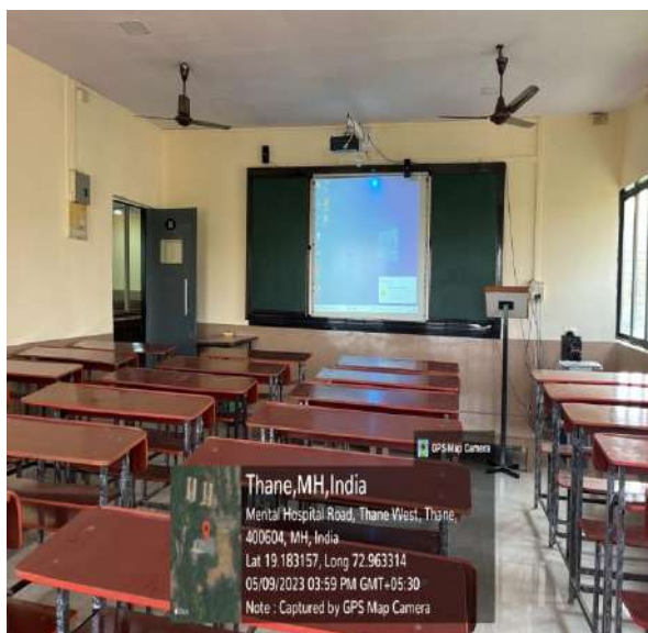
Class Room 35