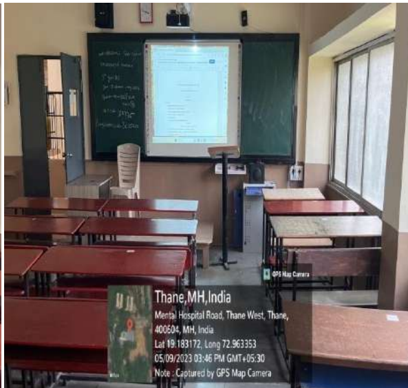
Class Room No. 28