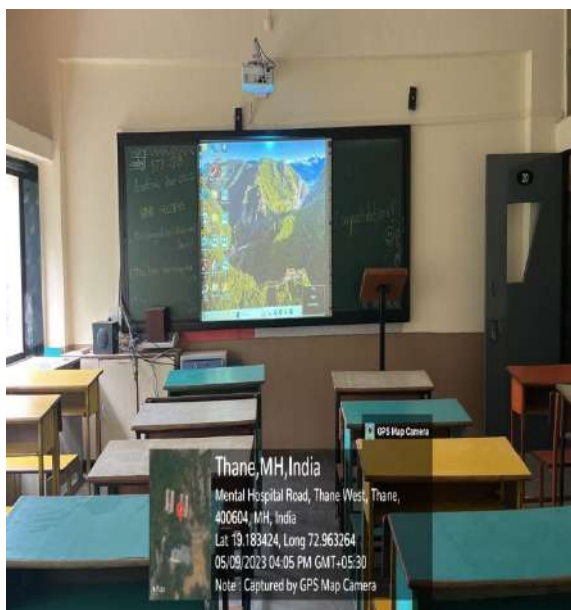
Class Room 20