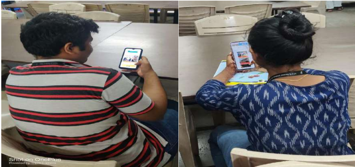
Use of Law Finders Software by Students

Tel.: 022-25820481 / 25830481 Email : avgcollegeoflaw@gmail.com