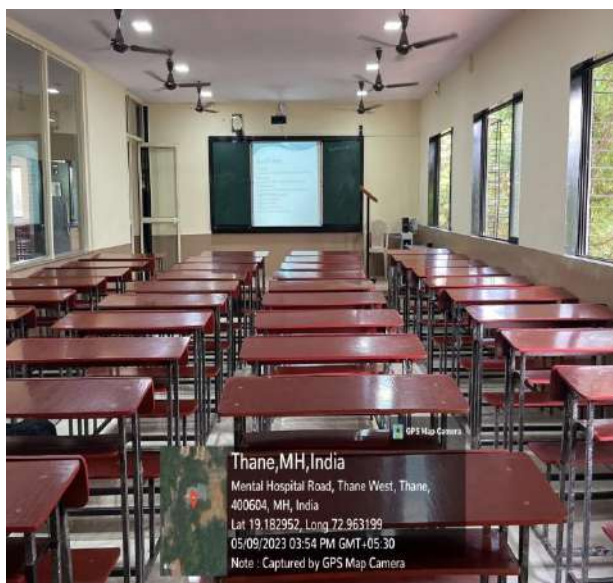
Class Room 33