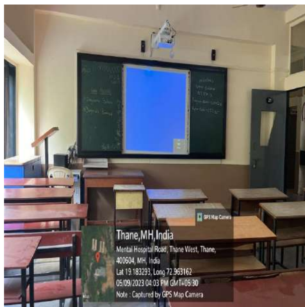
Class Room 21