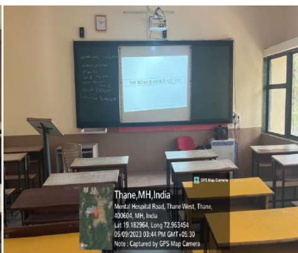
Class Room No. 26