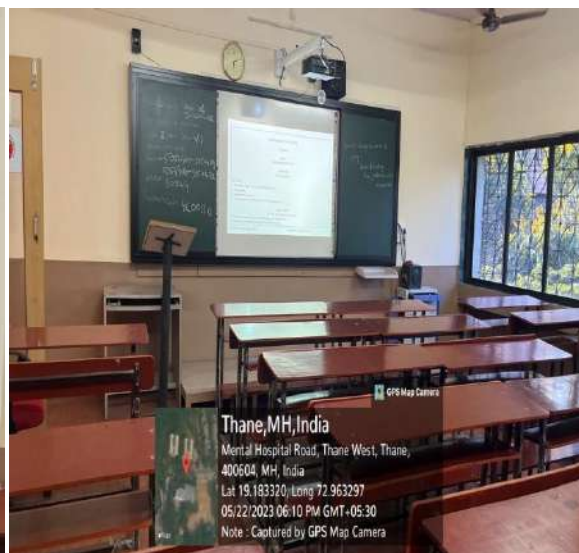
Class Room No. 30