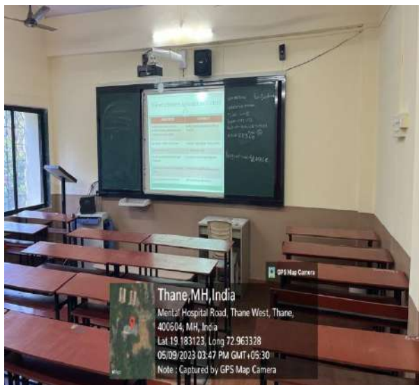
Class Room No. 29