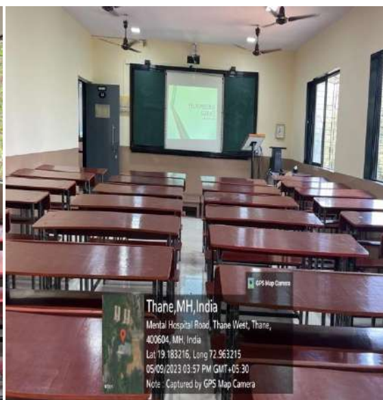
Class Room 34