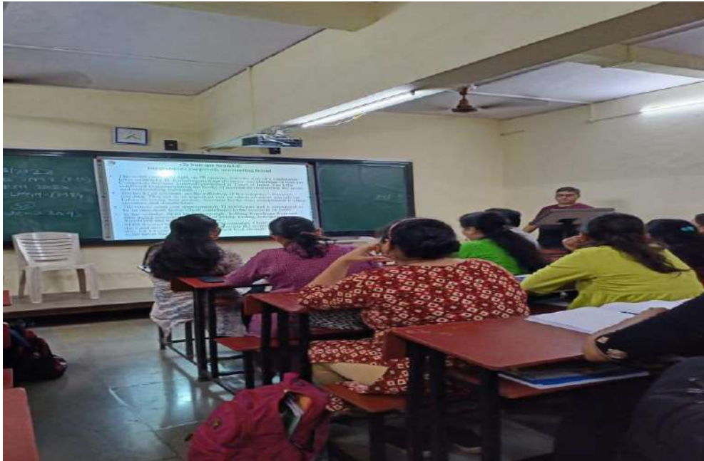
Use of ICT by our students while giving presentations

LL.B - 3 Years | LL.B - 5 Years | LL.M Diploma in Labour Law and Labour Welfare | Post Graduation Diploma in Cyber Law H. O. : Raghunath Nagar, Next to Mittal Park, Wagle Estate, Thane (W) - 400604. Tel.: 022-25820481 / 25830481 Email : avgcollegeoflaw@gmail.com