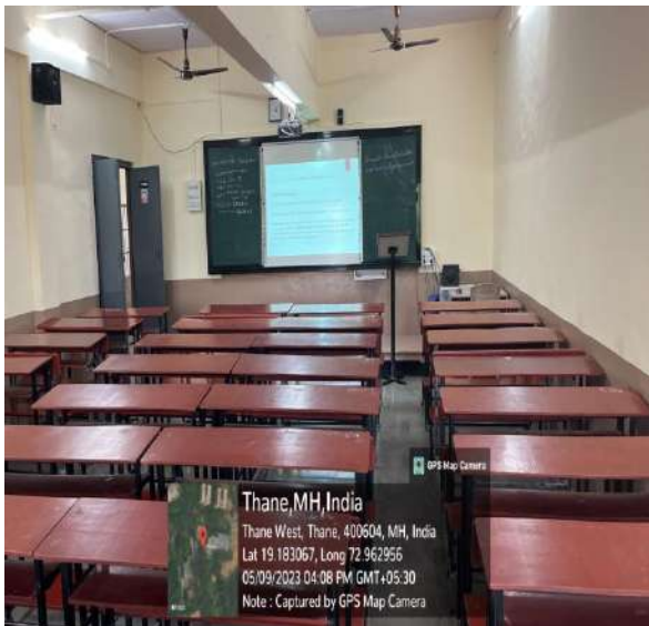
Class Room No. 27

H. O. : Raghunath Nagar, Next to Mittal Park, Wagle Estate, Thane (W) - 400604. Tel.: 022-25820481 / 25830481 Email : avgcollegeoflaw@gmail.com