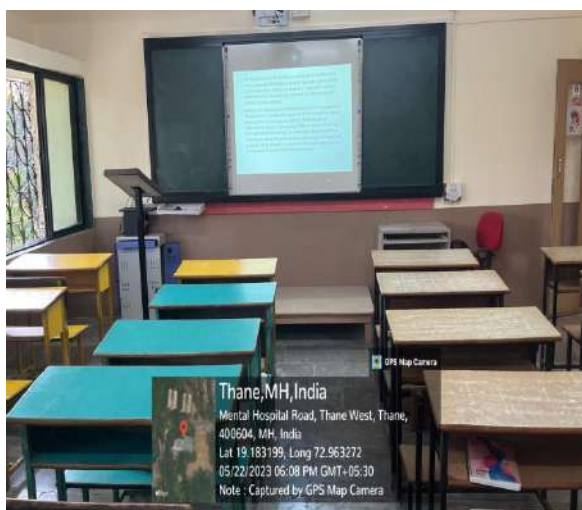
Class Room No. 25