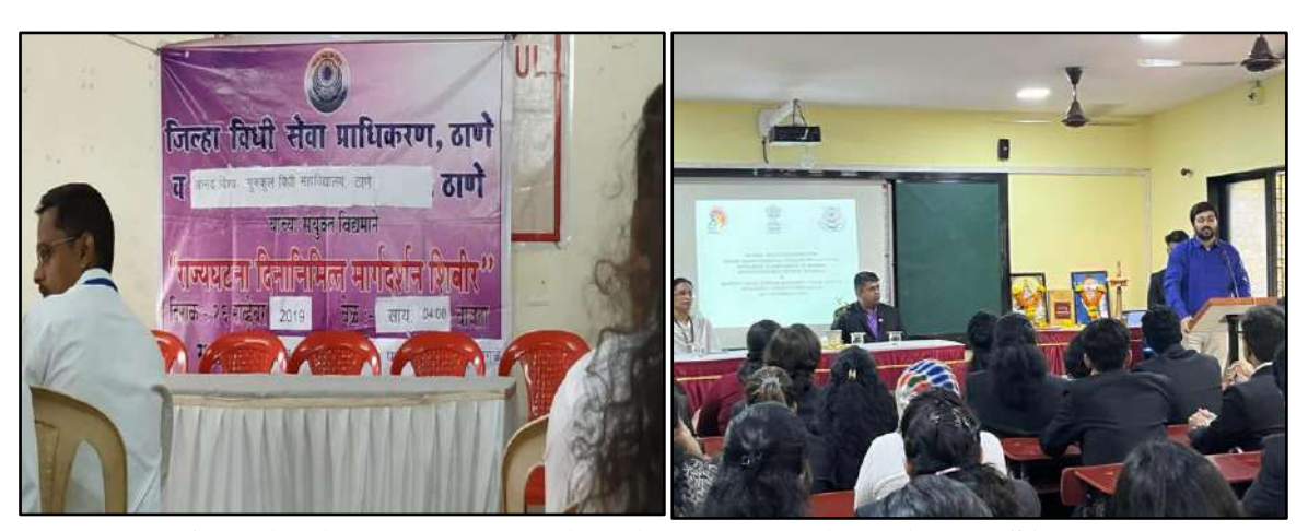
Constitution Day celebrations in collaboration with DLSA 2019