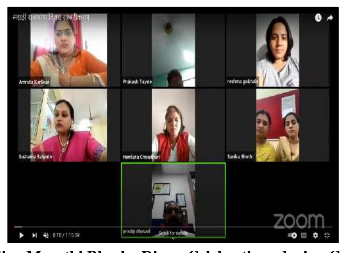
Online Marathi Bhasha Diwas Celebrations during Covid