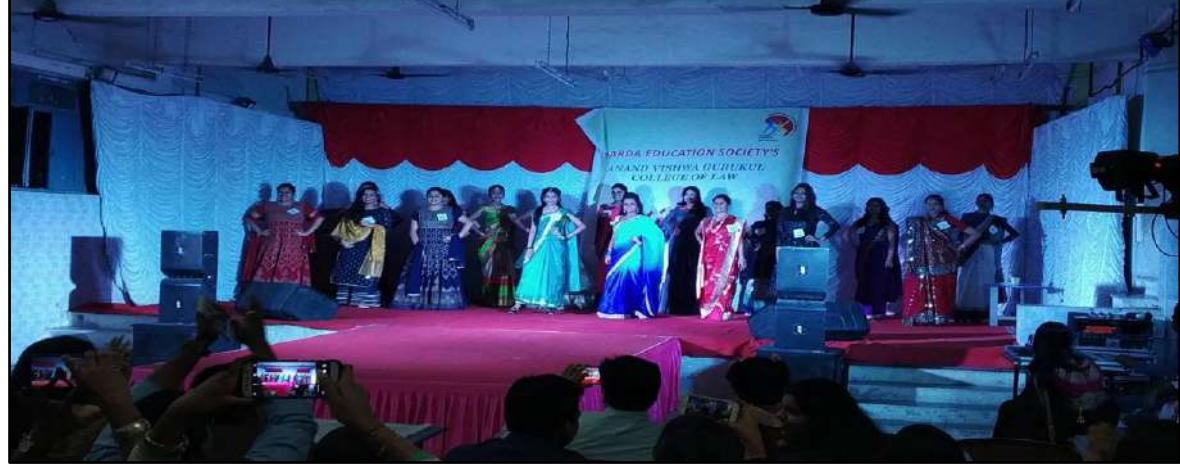
Cultural performances at Anand Lahar- the annual College Fest