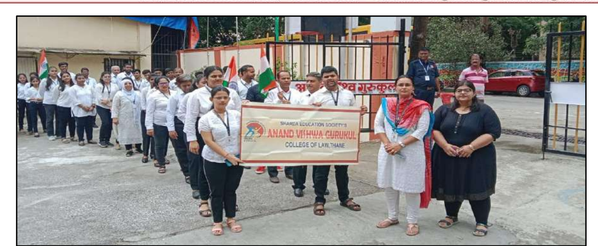
Azaadi ka Amrut Mahotsav at Anand Vishwa Gurukul College of Law

H. O.: Raghunath Nagar, Next to Mittal Park, Wagle Estate, Thane (W) - 400604. Tel.: 022-25820481 / 25830481 Email: avgcollegeoflaw@gmail.com