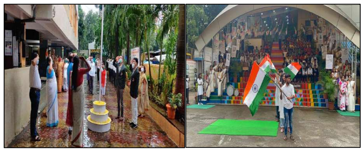
Independence Day and Republic Day Celebrations