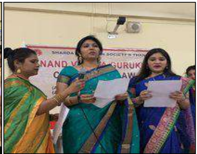
Marathi Bhasha Divas Celebration