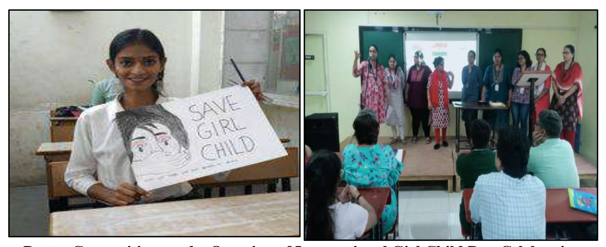
Poster Competition on the Occasion of International Girl Child Day Celebration