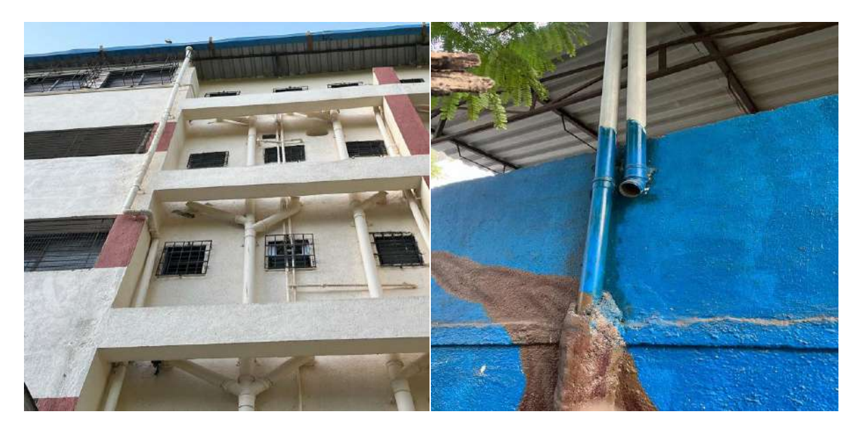
Pipes Originating from Roof Top Discharge Water Down to Ground Area and Garden