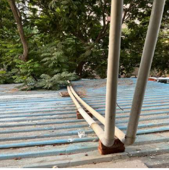
Disposal Pipes Diverting Roof Water down to Garden Area