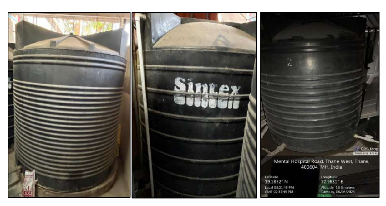
Ground Level Water Tank- 5000 litres each

Both these water tanks and water storage tanks at the top are cleaned at a regular interval. Each tank takes three days to clean with water and potassium permanganate. The dirty water is thrown out and this process is repeated 2-3 times. Water tanks are unlocked only for the process of cleaning, otherwise the water tanks remain locked.