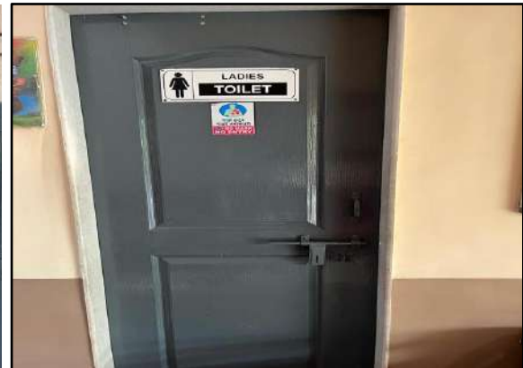
Separate washrooms for Boys and Girls with Peon's Chair in between