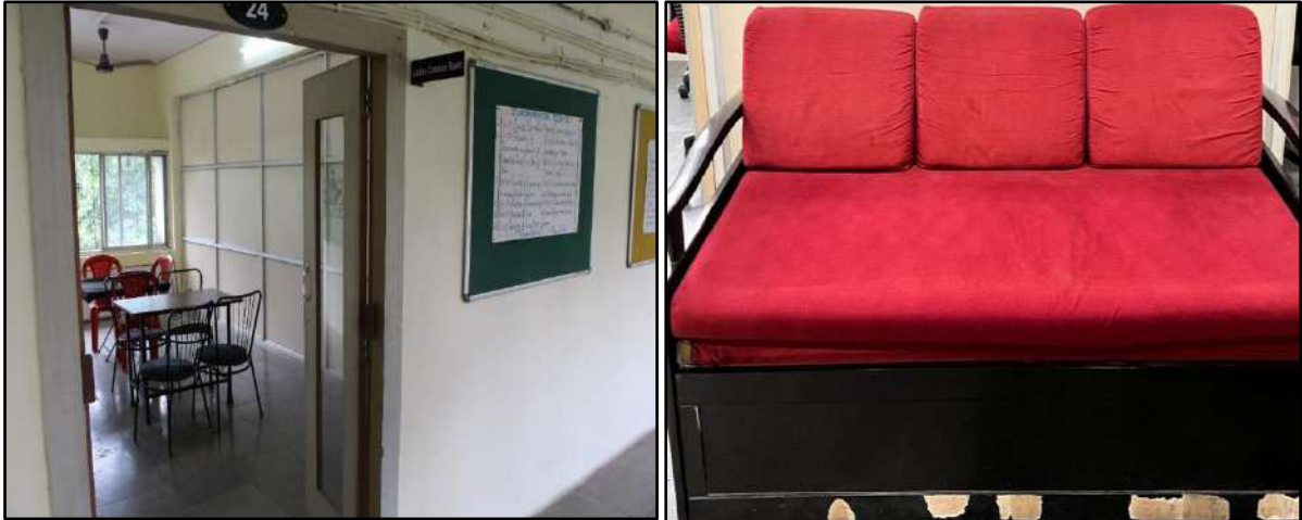
Ladies common room with the couch placed in the room for rest