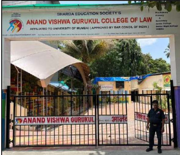
Security Guard at the College Entrance