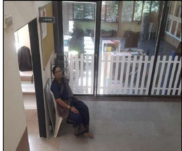
Female Support Staff to Monitor Discipline